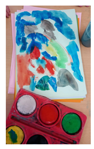
Children's brilliant creations at the arts and craft sessions on the Smithies Lane Travellers Site this month.